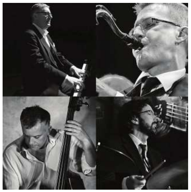
"A vibrant and moving homage" DOWNBEAT

Please bring own drink, glasses and nibbles A show laced with gentle anecdote, this is a vibrant, sophisticated celebration of the dazzling 60s music of Dudley Moore imaginative jazz pianist