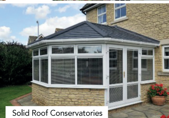
Solid Roof Conservatories