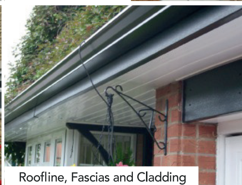
Roofline, Fascias and Cladding